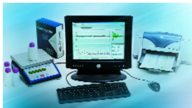
FreeWeigh.Net Compact with central PC and Viper Balance