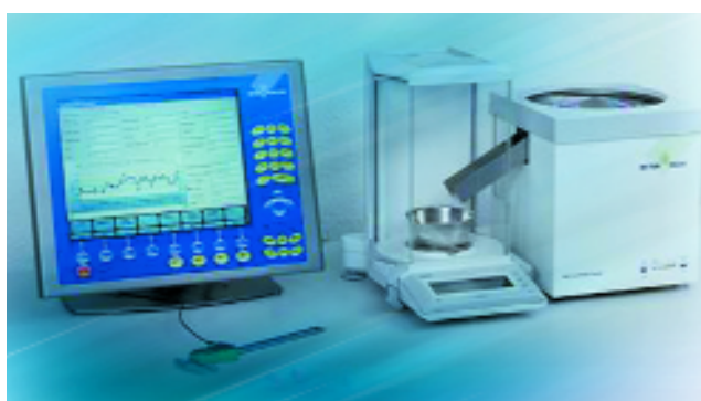
FreeWeigh.Net Compact with ID30, Balance and Tablet Feeder