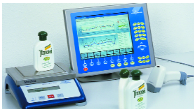
FreeWeigh.Net Compact with ID30, Balance and Bar Code