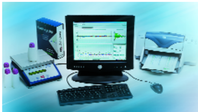
FreeWeigh.Net Compact with central PC and Viper Balance