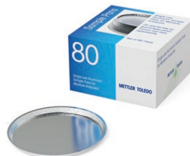
Aluminium sample pans