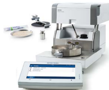
Certified temperature kit, Certified adjustment weight