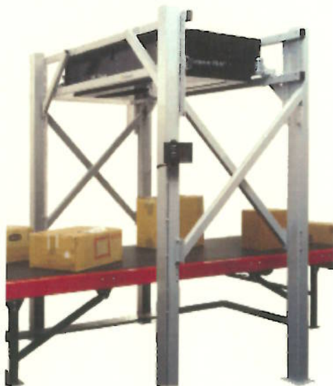
Figure 2: The CSN210 shown in a typical setup over a conveyor belt